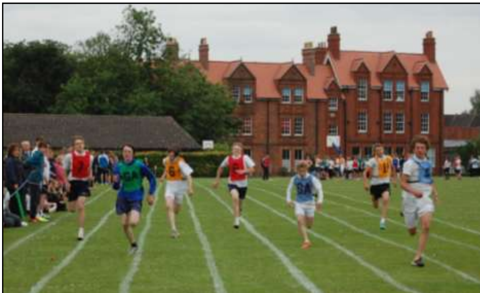
Sports Day Year 8 100m final