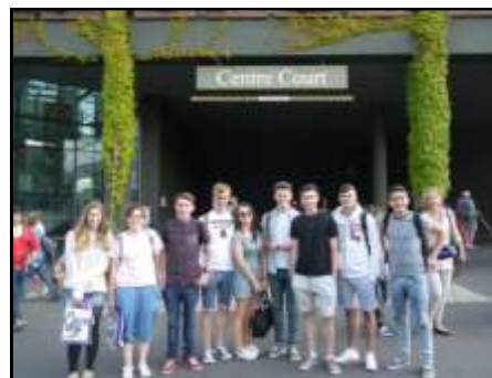
Year 11 visited Wimbledon