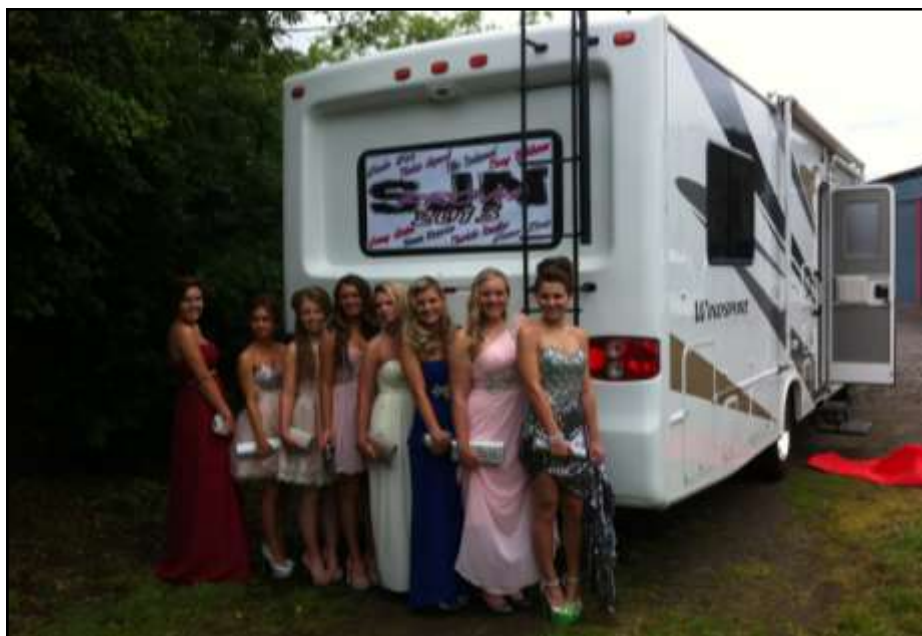
Year 11 students pictured here before setting off to the prom in their unique form of transport.