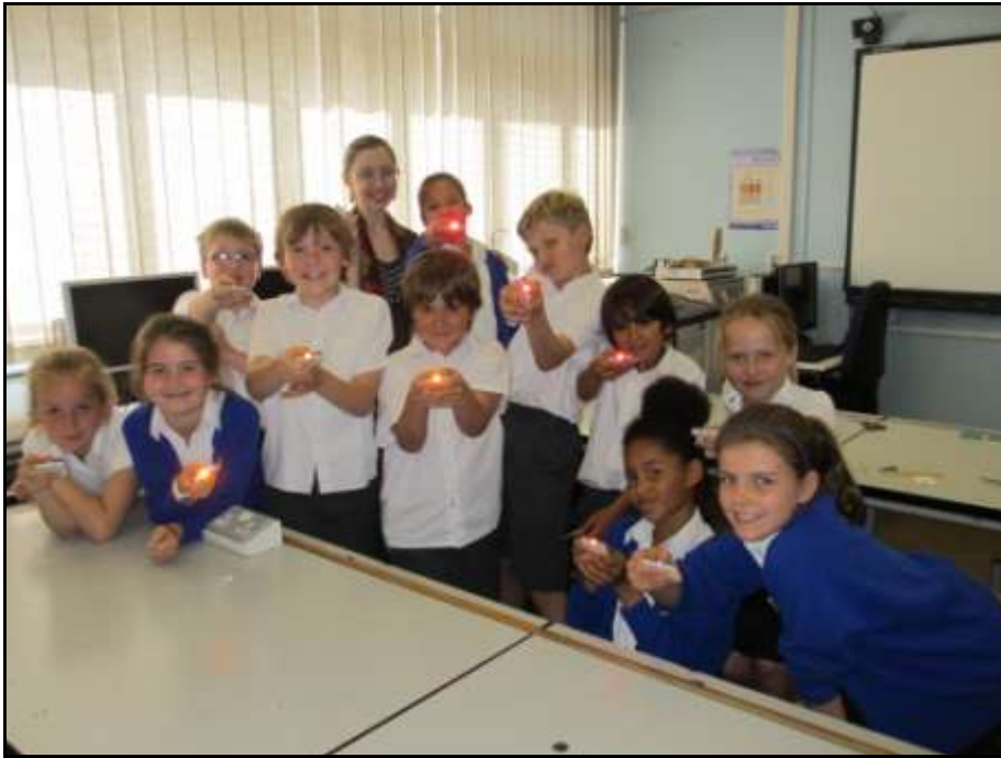
St. Mary's Primary Academy students show off their L.E.D. torches.