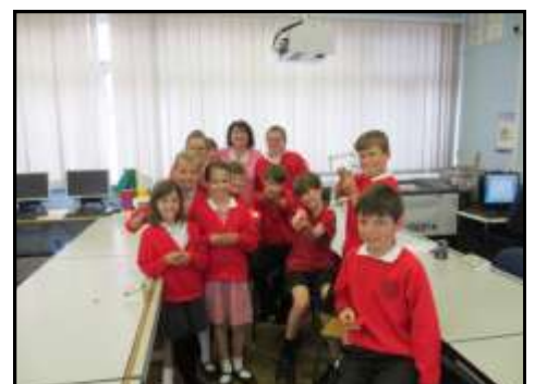
Products of the electronics workshop