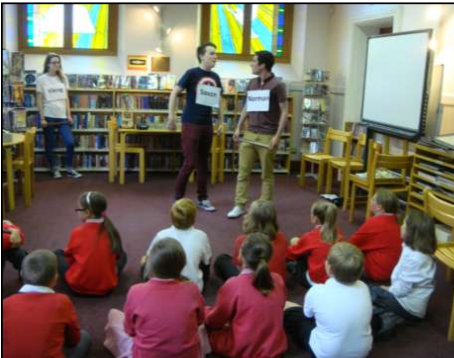
Year 5 Horrible Histories Drama Workshop with Year 12 students

Our thanks go to all the staff and 6 th Form Students for their time and efforts in making the sessions memorable, and most of all fun!