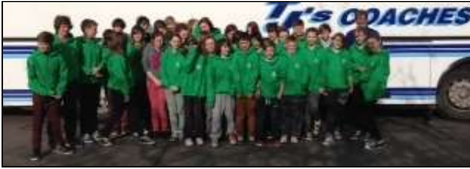
Y8 students before they set off on the Lake District Outward Bound trip