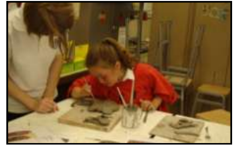
Working with clay to make masks