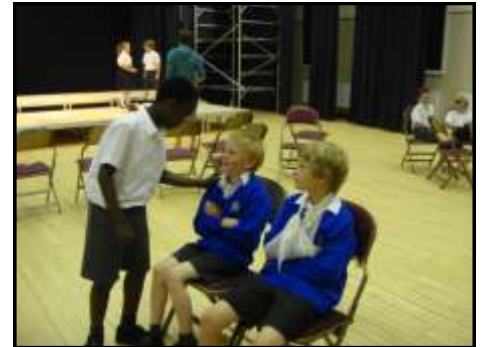
Pupils enjoying a drama workshop